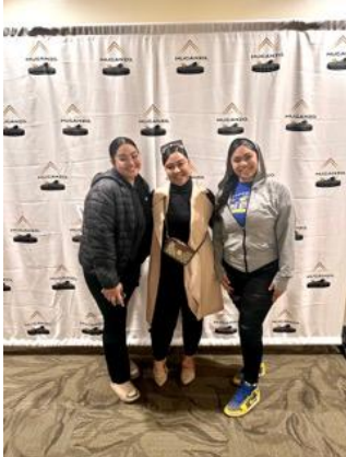
Sacramento State Big Hysto Event