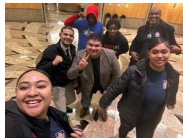
SKFC Take on City Hall