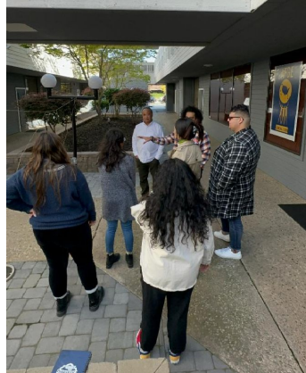
Sac Kids First Coalition Retreat Training