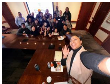
SKFC General Meeting